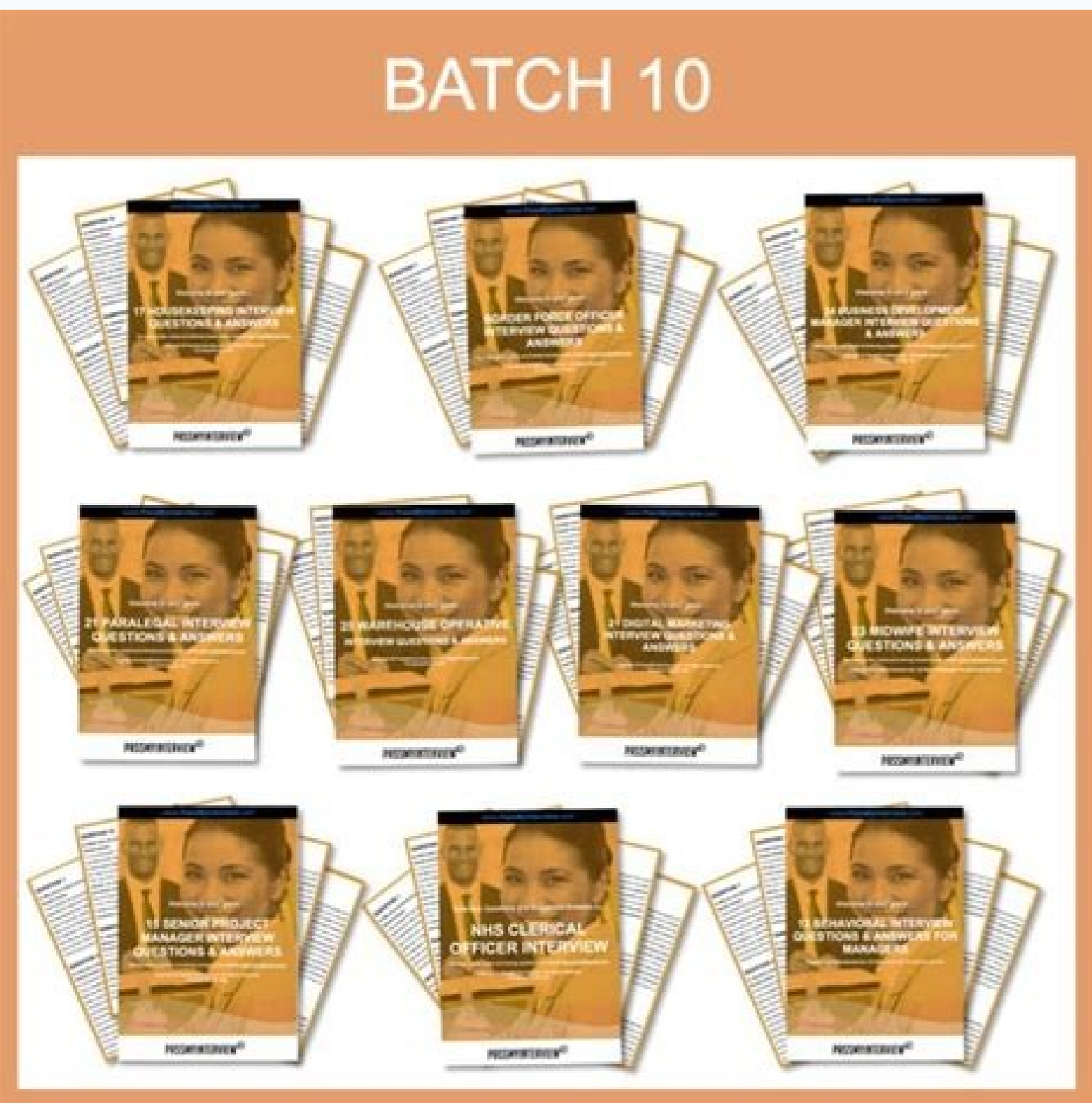
Business analyst interview questions and answers for insurance domain. Insurance business analyst interview questions and answers pdf.