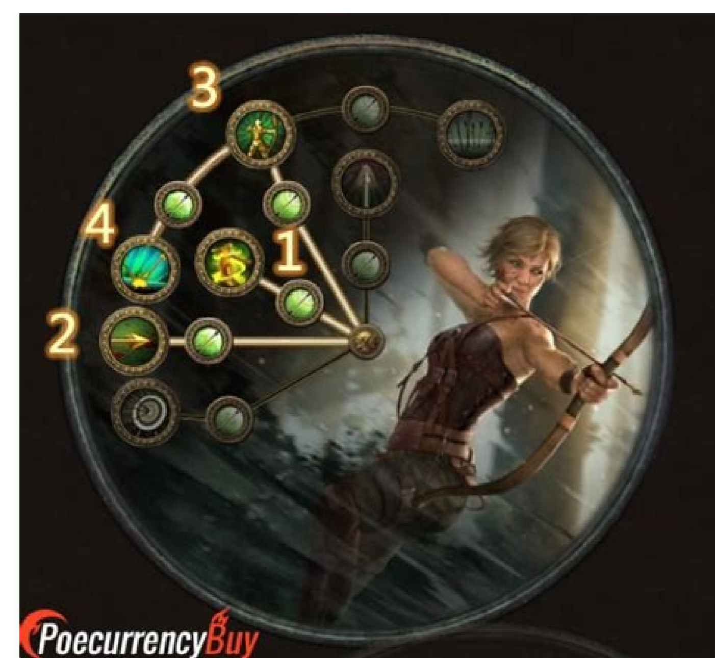
Crit based elemental hit deadeye build guide (poe ritual 3.13).